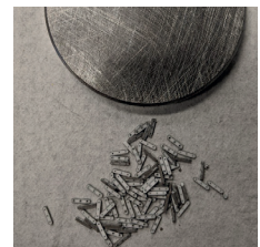
Clean parts after brown wax removed