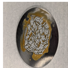
Dirty parts with brown wax residue