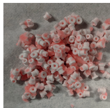
Dirty parts with pink wax residue

The company used water-soluble pink and brown waxes for their grinding/lapping operation. In conjunction with Morgan's sister company in California, they identified an aqueous mixture of Borax and Arm & Hammer™ baking soda at 180°F designed to clean both types of wax from the ceramic parts, but in order to make it effective for the New Bedford facility, Morgan needed to invest in a new piece of equipment. Importantly, the new equipment needed a filtration system to remove the thin layer of wax left after the cleaning operation.